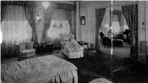
An attractive suite