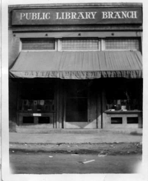
Dayton Avenue Branch Oct. 11, 1920-Apr. 30, 1927.

The interior furnishings of the above pictured edifice consisted of one office desk for charging, one catalog, three long tables and two short ones, with shelves on both sides, the children's books on one, the adult on the other; magazine files across the back, and two strips of fiber carpet down each side aisle. A partition across the back furnished a sort of staff room with a sink and a table. The street in front belonged to the L. A. Railway company so did not have the cleaning service of the city.