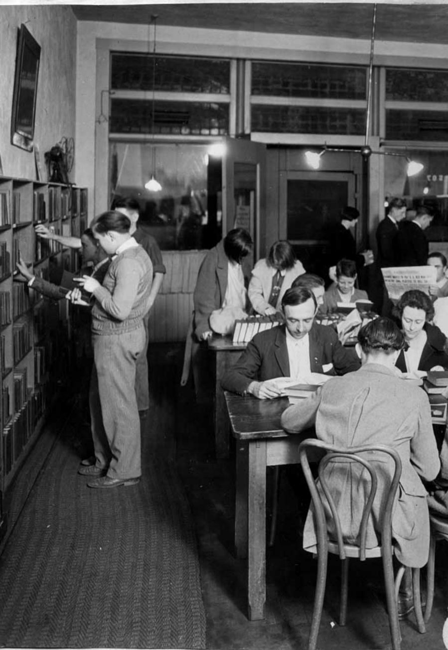
Interior of Dayton Branch