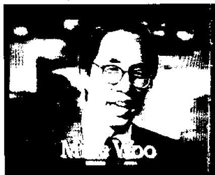
Under fire for connection to discriminatory lending policies