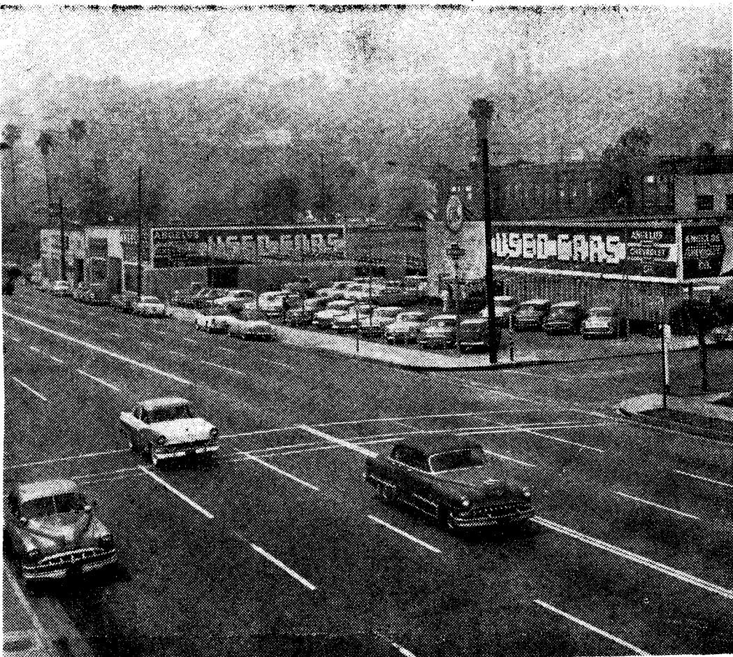
SAME VIEW—49 YEARS LATER —Angelus Chevrolet property now almost blocks view of old red brick Occidental College building still standing sturdily as a present-day apartment