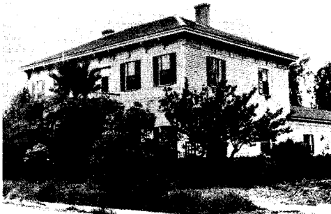
Drum Barracks Officers Quarters — Only Building Still Standing