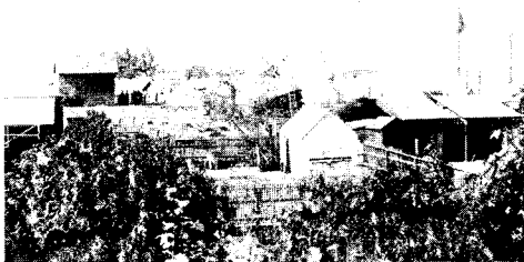
Drum Barracks About 1864

were well acquainted with the western country and thought the whole territory especially well adapted to the habits of the animal. Congress, in March, 1855, appropriated $30,000 to be used by the War Department for the importation of dromedaries and other camels to be used for military purposes.